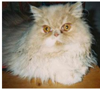
Cream : buff (dilute of red) faint Tabby markings