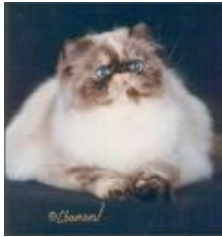
Tortie Point – Tortie patterns on points