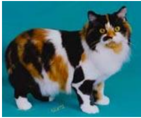
Calico – orange and black with patches of white