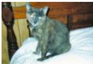
Dilute Tortoiseshell – blue and cream mottled pattern