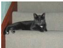
Locket – small spots of white on the chest of an otherwise colored cat