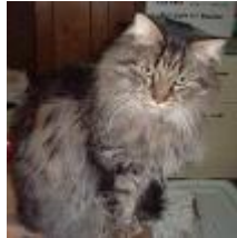
Domestic Medium Hair