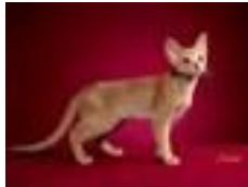
Fawn : "hotter" version of cream