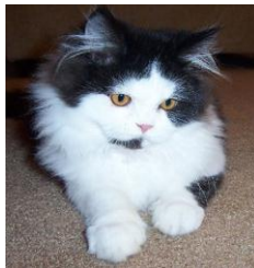
Bicolor – one to two thirds white with patches of color on the head and torso