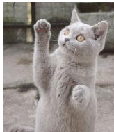
Lavender / Lilac / Frost : warm blue-brown, or pinkish frosty gray (dilute of chocolate)