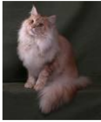
Cameo / Red Silver Tabby : cream base, pale red markings