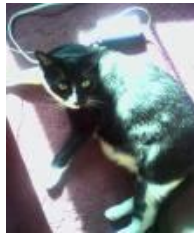
Button – Colored cat with one or more white belly spots