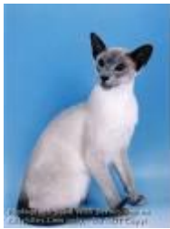
Wedge head shape