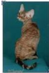
Chocolate / Chestnut Tabby : cream base, milk-chocolate brown markings