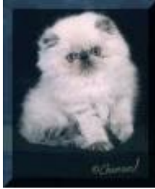
Colorpoint – unpatterned or solid points