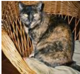
Tortoiseshell – black and red mottled pattern