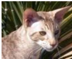
Cinnamon Tabby : pale brown base, cinnamon markings