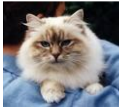
Caramel Tabby : cream base, biscuit-color markings