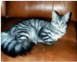
Silver Tabby – silver base with black markings - mutation that removes the appearance of yellowish-tan pigmentation