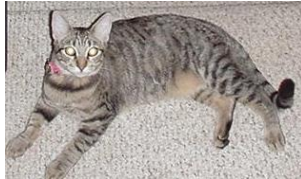
Brown Tabby : coppery-brown base, black markings