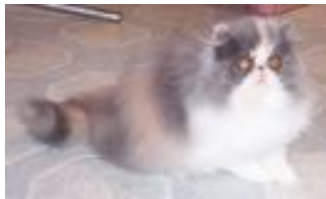
Dilute Calico – blue and cream patches