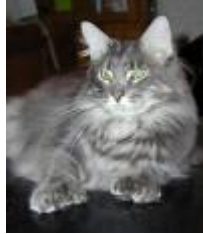
Blue Tabby : cream/ivory-blue base, slate blue markings