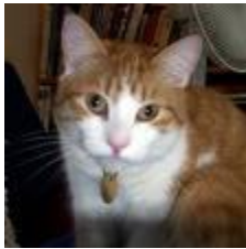
Rectangle head shape