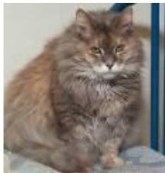
Domestic Long Hair