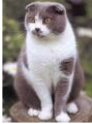
Round head shape