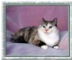
Mitted – white on paws