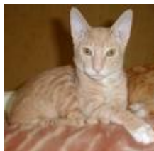
Cream Tabby : pale cream base, fawn markings