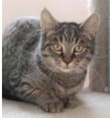
Domestic Short Hair