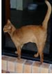
Cinnamon : milk-chocolate / light brown