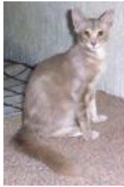
Fawn Tabby : pale pink-beige base, lilac markings