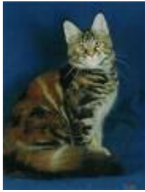
Torbie – Tortie with Tabby pattern