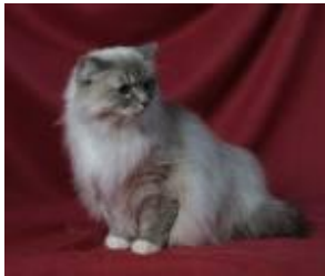
Lynx Point – striped patterns on points