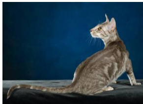
Lavender / Lilac Tabby : milky cream base, frosty gray markings