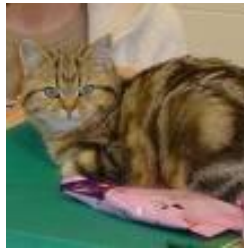
Golden Tabby : tabby on golden undercoat (chinchilla/shaded)